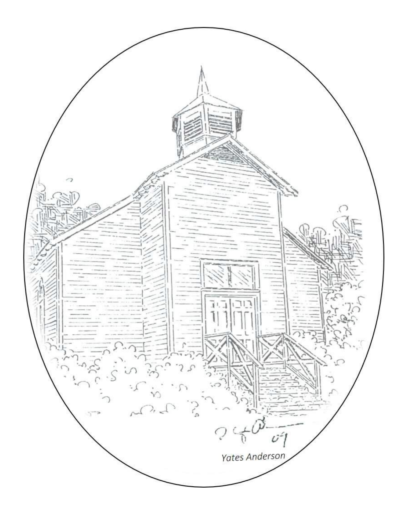
Lake Toxarvay United Methodist Church February 23<sup>rd</sup>, 2025